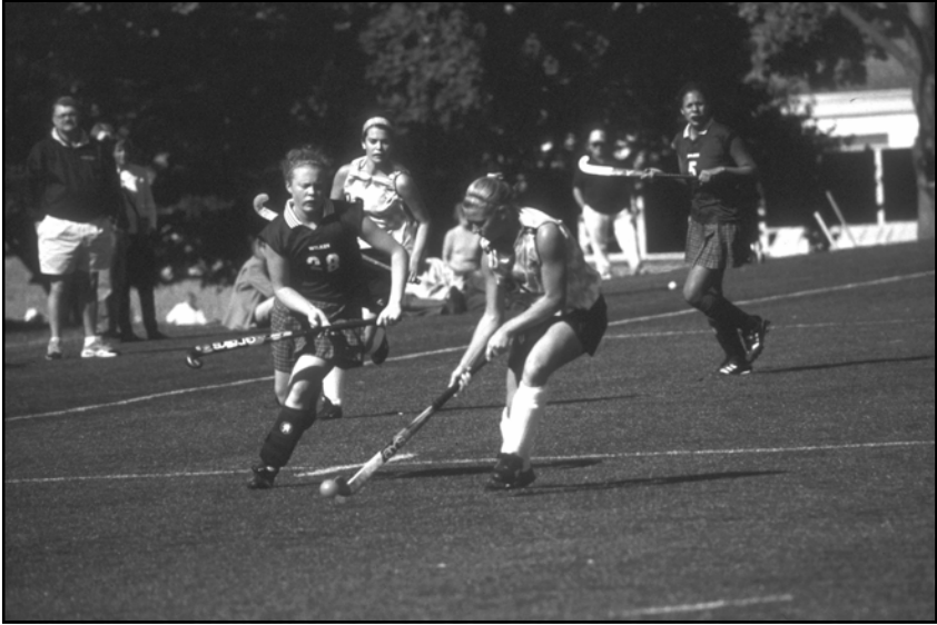
The field hockey team competes on state-of-the-art artificial turf surface that is the envy of the Commonwealth Conference.

pline program. For guidelines and details as to requirements, students should consult the department chair.